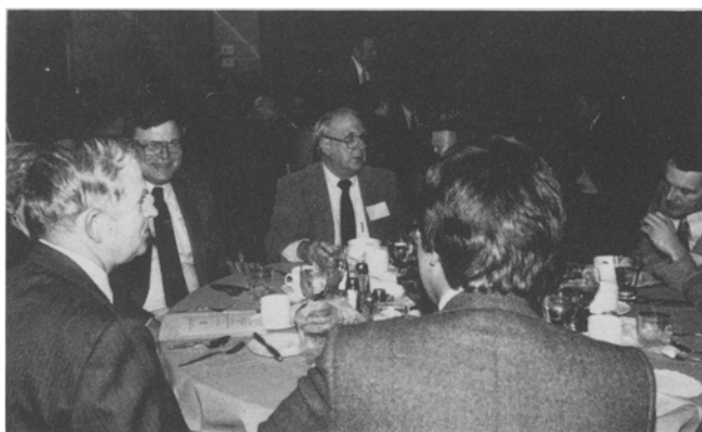
Approximately 60 persons attended the 1984 Bailey Award dinner sponsored by the North Central Section of the AOCS this past February.